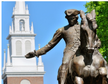
Patriot's Day 18 April