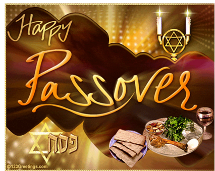
Passover 23 – 30 April