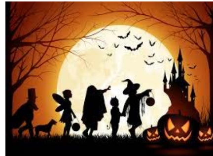
October 31 Happy Halloween!