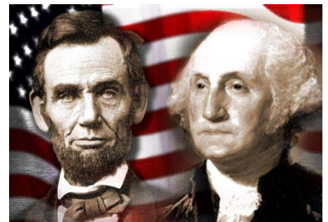
President's Day February 19, 2018