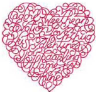
Happy Valentine's Day February 14, 2018